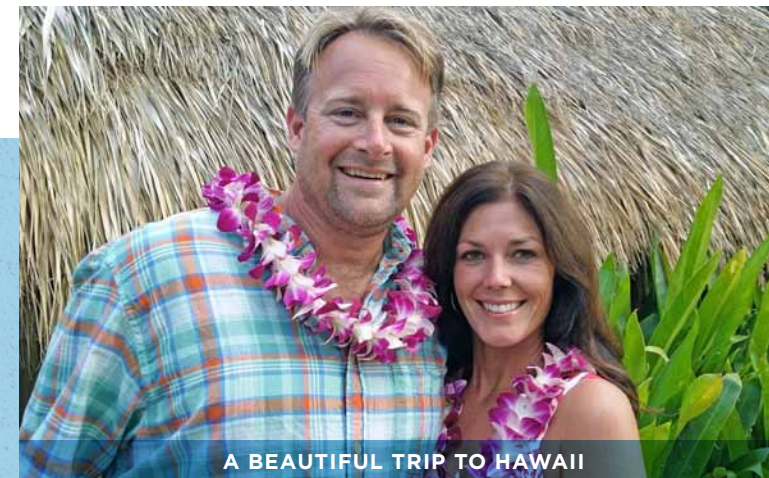
A BEAUTIFUL TRIP TO HAWAII