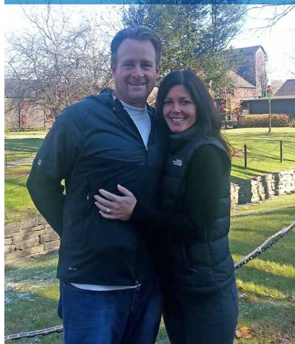
SIGHT-SEEING IN KENTUCKY