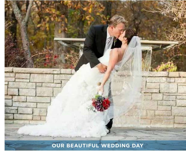
OUR BEAUTIFUL WEDDING DAY

We have had challenges in life but nothing as significant as our struggles with infertility. We've grown together throughout the experience and see it as a positive sign to pursue adoption. OUR FAITH AND OVERWHELMING DESIRE TO PARENT TOGETHER HAVE BROUGHT US TO THIS STAGE.