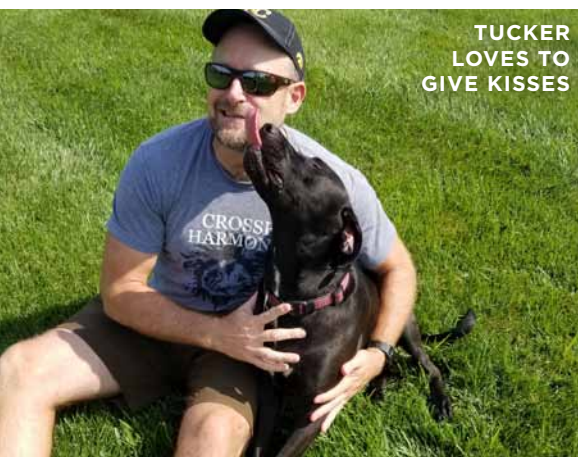
TUCKER LOVES TO GIVE KISSES