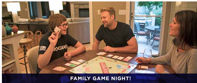
FAMILY GAME NIGHT!

Our neighborhood is a large subdivision with a pool, playground, walking trails, tennis courts, basketball courts, and a lake to go fishing! There are always activities throughout the year like fall festivals, 4th of July parade, and even pool parties. One of the best parts of our neighborhood is the schools. We have some of the best schools in the nation and the elementary school and middle school are just a couple blocks away. WE CAN'T WAIT TO SHARE ALL OF THIS WITH OUR FUTURE CHILD!