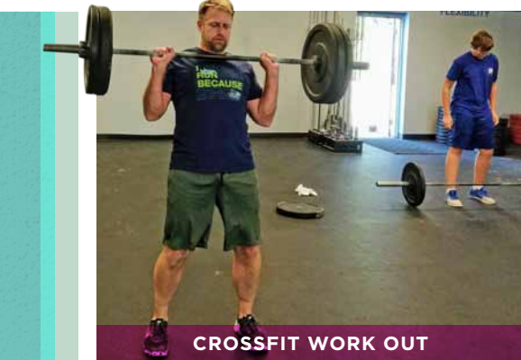
CROSSFIT WORK OUT