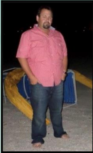
A night at the beach!

I started my career in the construction industry after high school. I quickly went from being a framer to leading my own crew. I went on to get my contractors license to further advance my career. Currently I am a superintendent for a national home builder. I like working with my hands and doing things around the house. When I am not working, you can usually find me outside or relaxing on the couch.