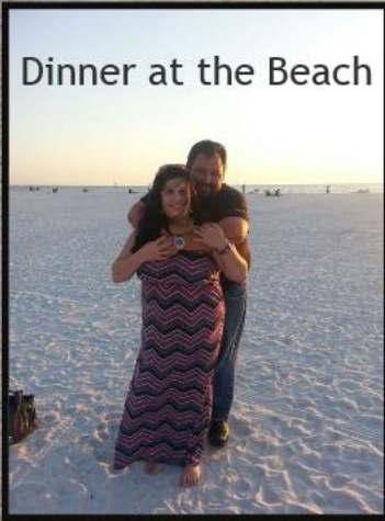
Dinner at the Beach