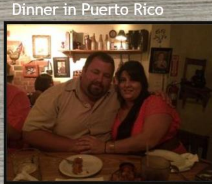
Dinner in Puerto Rico