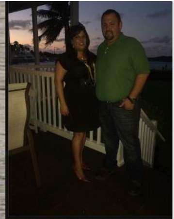
Key West Sunset