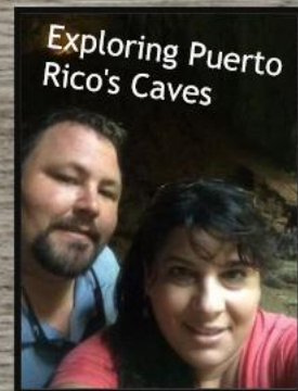
Exploring Puerto Rico's Caves