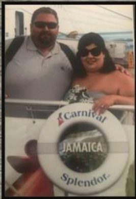
Waterfalls in Ochos Rios, Jamaica