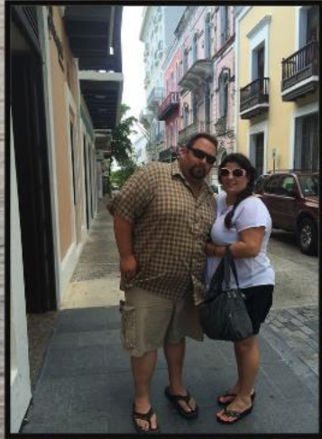
Touring Old San Jaun